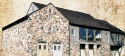
The Barn Visitors Center

PO Box 27, 1736 Creek Road Chadds Ford, PA 19317 Phone: 610-388-7376 info@chaddsfordhistory.org www.chaddsfordhistory.org