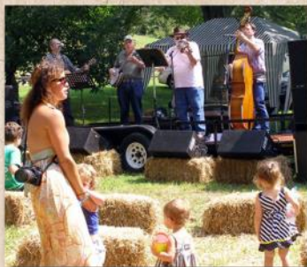
Valley Jamboree May 18 & 19